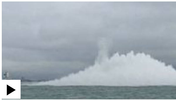
Watch World War II German sea mine being blown up