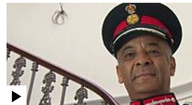
Ken Olisa named 'most influential black Briton'