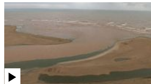
Toxic mud concern after Brazil dam burst