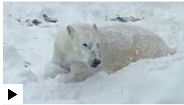
Polar bear enjoys snow at US zoo